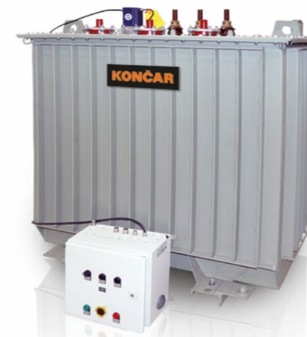
Distributivni transformator s regulacijom pod naponom / Voltage regulated distribution transformer

Prior to delivery all transformers are routine tested according to standard IEC 60076 (if required, acc. to other standards also). On customer's request, type and special tests are carried out.